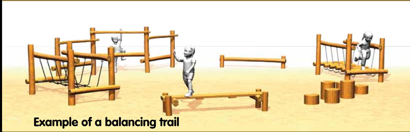
Example of a balancing trail