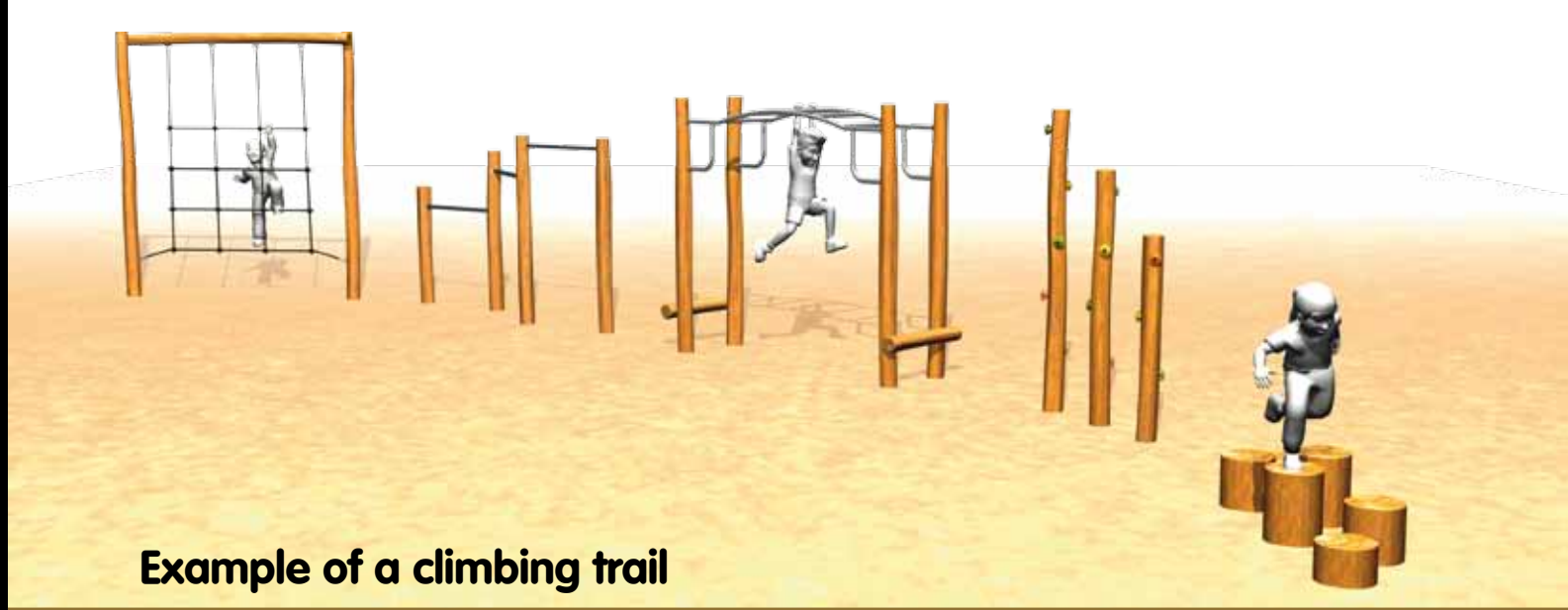
Example of a climbing trail

As they advance, the pieces become progressively narrower, higher and more challenging. The techniques needed to negotiate each obstacle become more varied and complex and involve developing special awareness and dexterity.