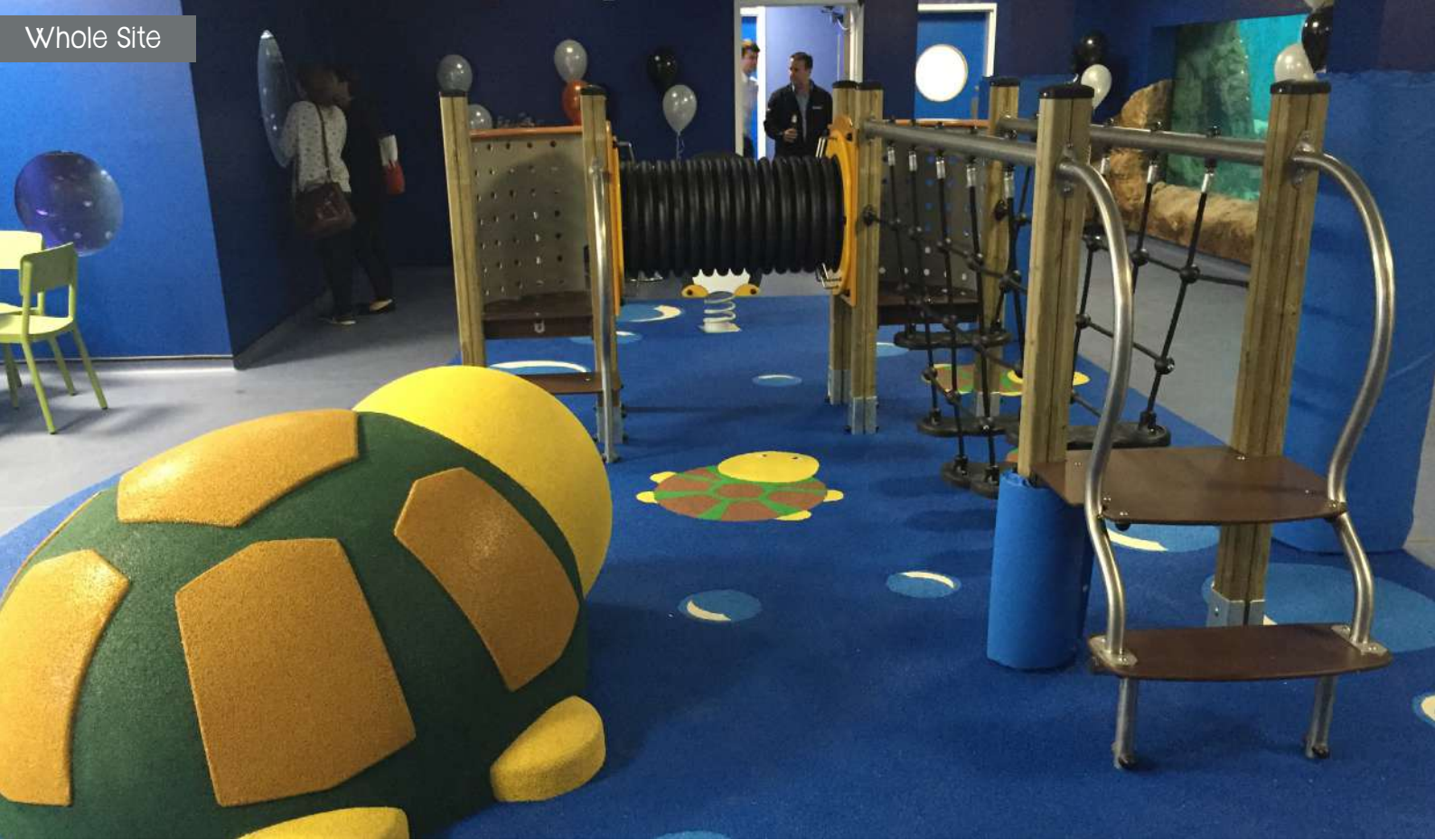
3D Play Turtle